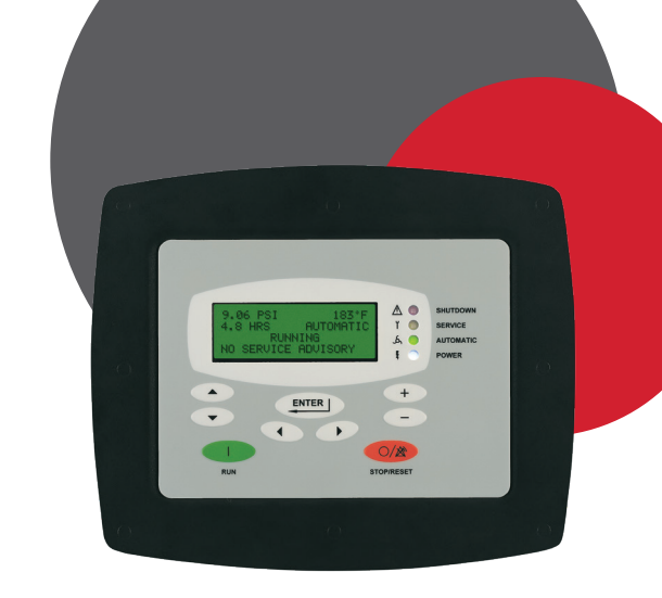
Air Smart Controller