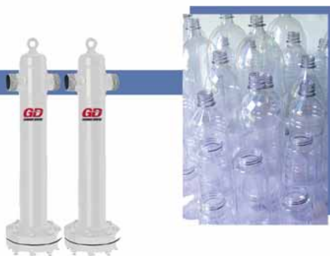
Grades C & E